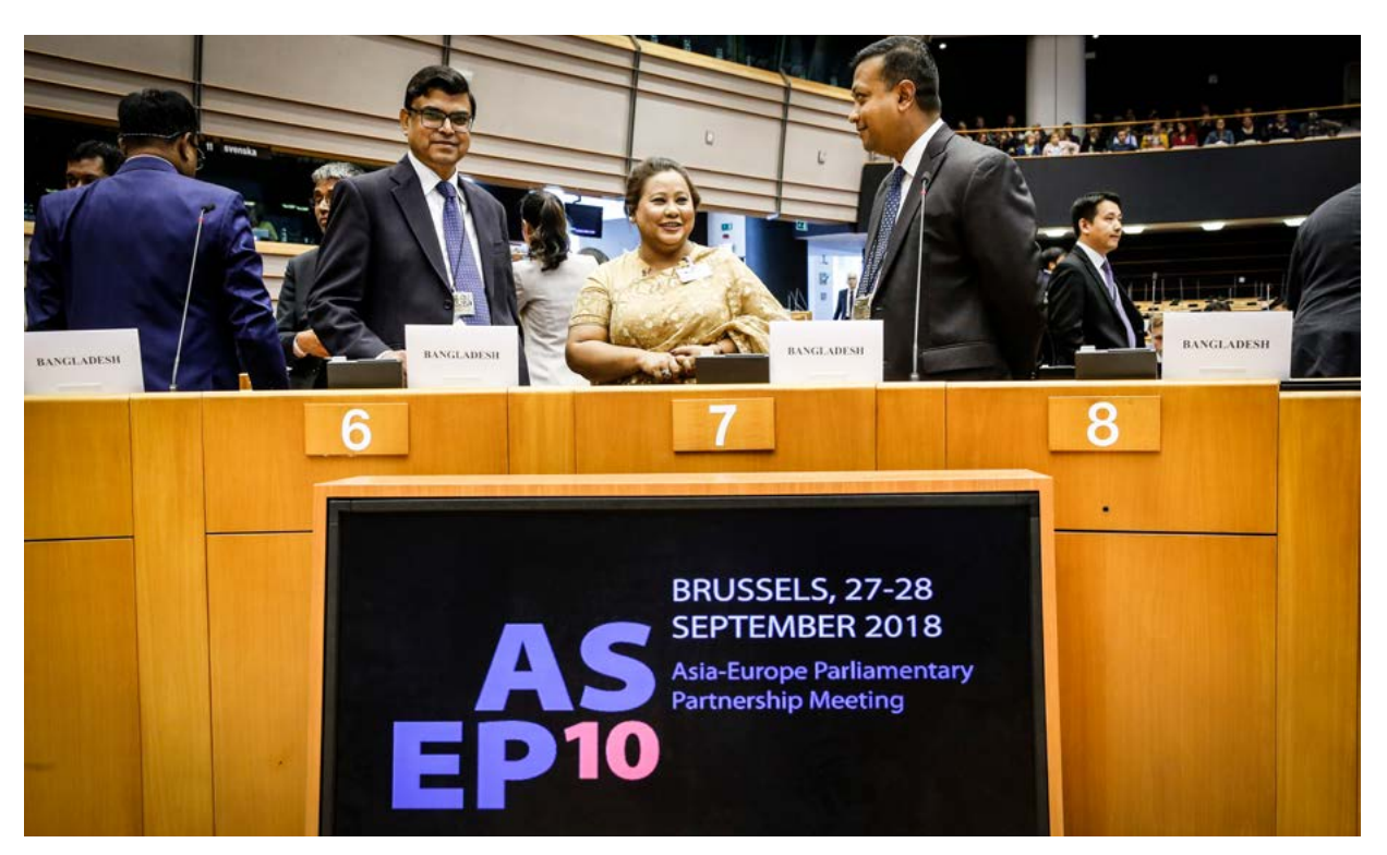
10th Asia-Europe Parliamentary Partnership Meeting (ASEP 10) of 27 September 2018

The Asia-Europe Parliamentary Partnership (ASEP) is the parliamentary dimension of the Asian-European political dialogue, seeking to enhance relations between Europe and Asia. The most visible element of this dialogue has traditionally been the biennial Asia-Europe Meeting (ASEM), an intergovernmental summit first held in 1996. ASEP provides parliamentary input and networks ahead of this summit to facilitate proceedings. As one of ASEP's objectives is to influence the agenda of the ASEM, ASEP is usually held in the same place as the summit, but slightly earlier. In 2018, the 10th ASEP meeting (ASEP 10) took place on 27 and 28 September in Brussels. For the first time, it was hosted by the European Parliament.