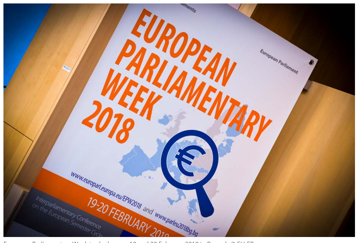
European Parliamentary Week took place on 19 and 20 February 2018 in Brussels

As a bi-annual IPC within the framework of the Austrian EU Presidency, the second Interparliamentary Conference on Stability, Economic Coordination and Governance in the European Union of 2018 was hosted by the Austrian Parliament on 17 and 18 September 2018 in Vienna. The IPC centred on an exchange of views on the following four topics: