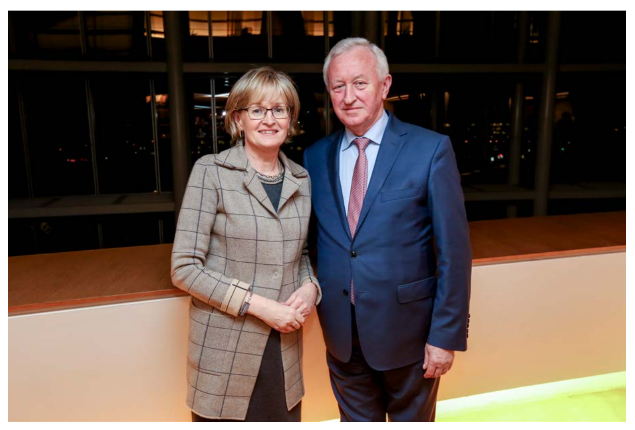
Vice-Presidents Mairead McGuinness and Bogusław Liberadzki

In line with the Treaty of Lisbon, national Parliaments together with the European Parliament have been given the task of scrutiny and oversight in the area of Justice and Home Affairs, in particular regarding Europol and Eurojust. The work of the Joint Parliamentary Scrutiny Group on Europol (JPSG), established in 2017, has been a major new development in interparliamentary cooperation. Its main task is the political monitoring of Europol's activities in fulfilling its mission at a time when Europol's role in fighting terrorism and organised crime has become increasingly important.