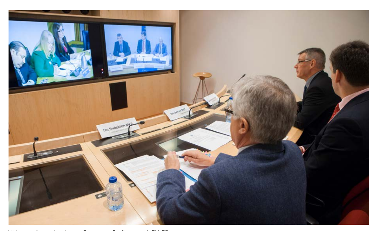
Videoconferencing in the European Parliament

Videoconferencing between EU national Parliaments and the EP allows parliamentarians to stay in regular contact on a particular issue over time or to arrange discussions on current issues such as draft legislation. The EP has also offered national Parliaments the possibility of participating in one of its regular interparliamentary meetings via videoconference and will aim to do so in the future whenever possible.